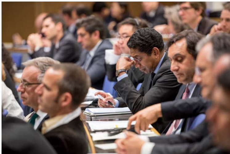
A packed auditorium during a plenary session