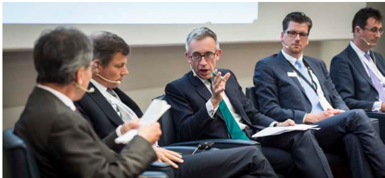
Panel discussion debating why projects fail and how to measure sustainability and resilience risks and benefits