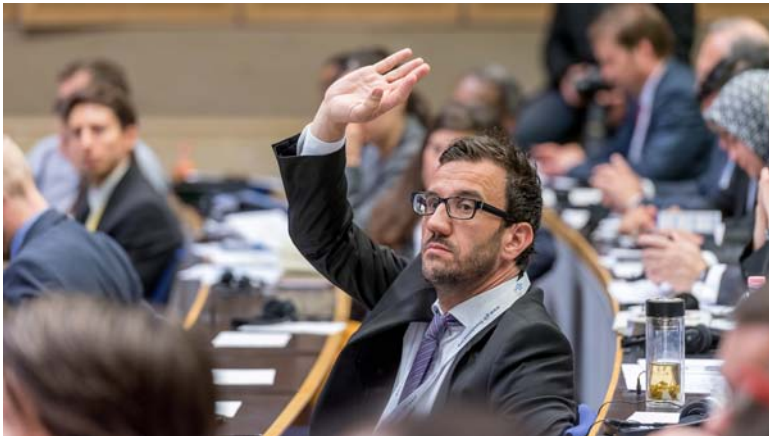
Audience participation during the workshop on measuring risk