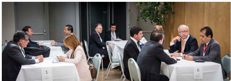
Matchmaking platform, bilateral meetings

4 th GIB Summit last year. This year a total of 192 participants used the matchmaking platform and 220 bilateral meetings were scheduled during the summit, an increase from last year's summit and confirmation that the platform continues to be a great success.