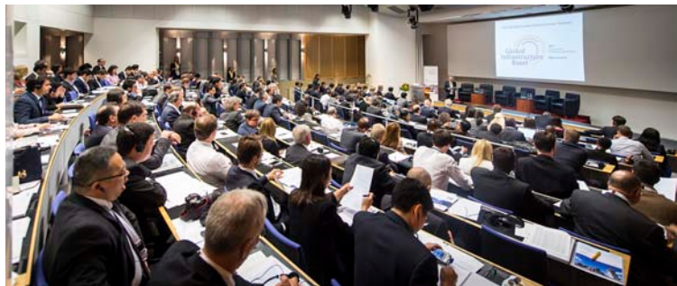
Audience during the opening plenary