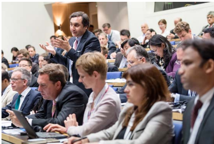
Audience members had opportunities to ask questions and comment on sessions